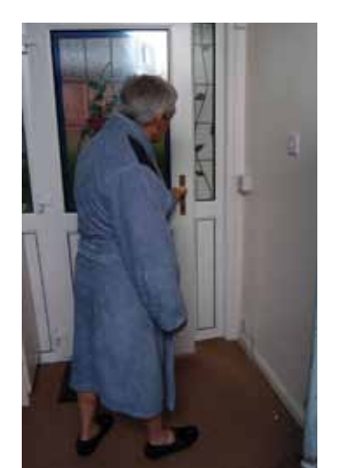
Property exit sensors These detect when a door has opened or been left open

Detect movement seizures to alert people