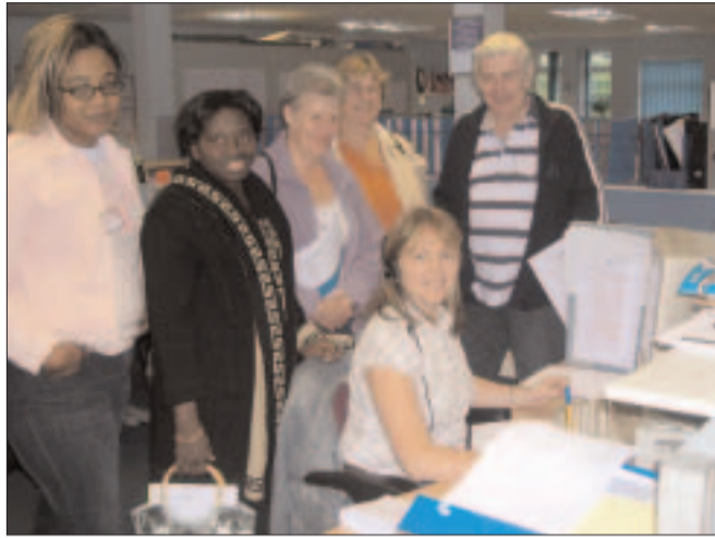
Residents look behind the scenes at our call centre.

Residents were also shown what a vital role the Hounslow