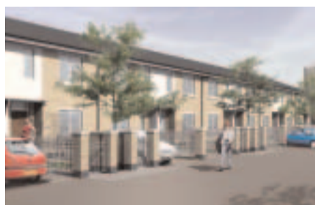
A computer image of the new look estate.

A major regeneration programme will begin this month at Convent Way estate in Heston.