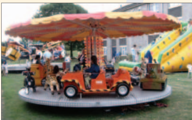
Children's rides at the Convent Way funday.

If you would like a copy of this publication in another language, or format please call 020 8583 2299 or minicom on 020 8583 3122.