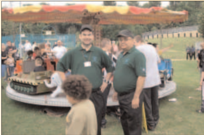
Right: Neighbourhood Wardens join in the fun at the Clayponds funday.