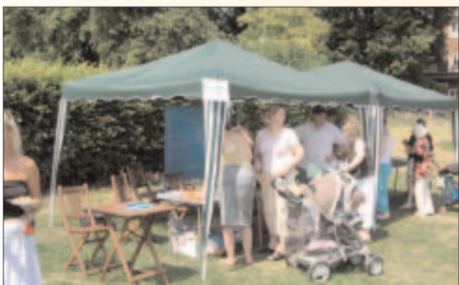
Fun in the sun at the Dukes Meadow funday.