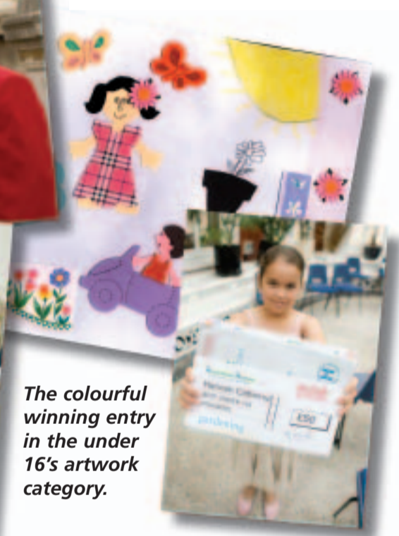
The colourful winning entry in the under 16's artwork category.