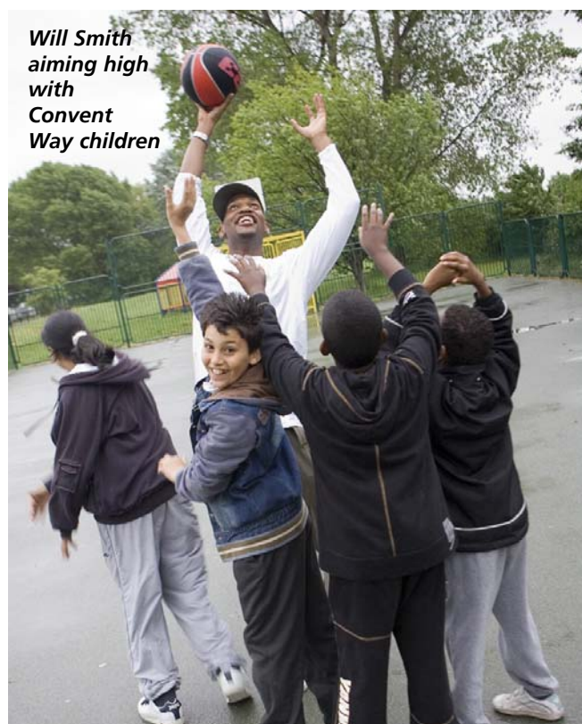
Will Smith aiming high with Convent Way children

Hounslow Homes regeneration projects continue on other estates around the borough.