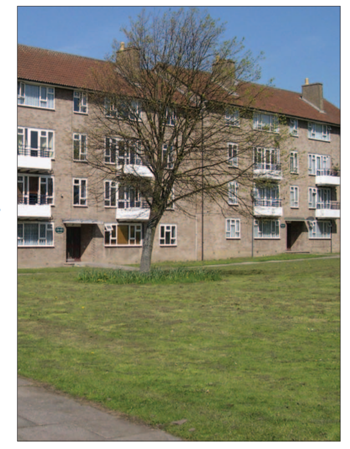
Elmwood Avenue is just one of the estates shortlisted for possible inclusion in the Decent Estates Programme.

We will publish the list of estates that will be part of phase one of the programme later this year.